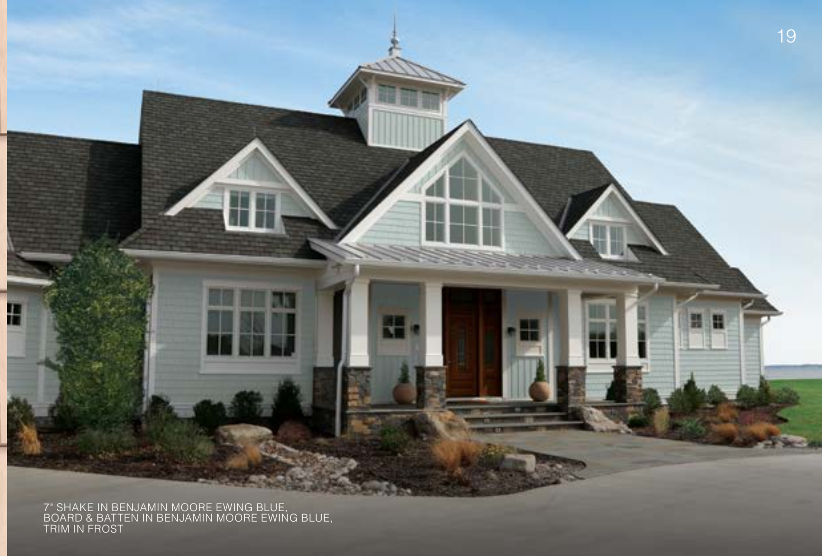
7" SHAKE IN BENJAMIN MOORE EWING BLUE, BOARD & BATTEN IN BENJAMIN MOORE EWING BLUE, TRIM IN FROST