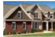
HAVEN® INSULATED SIDING