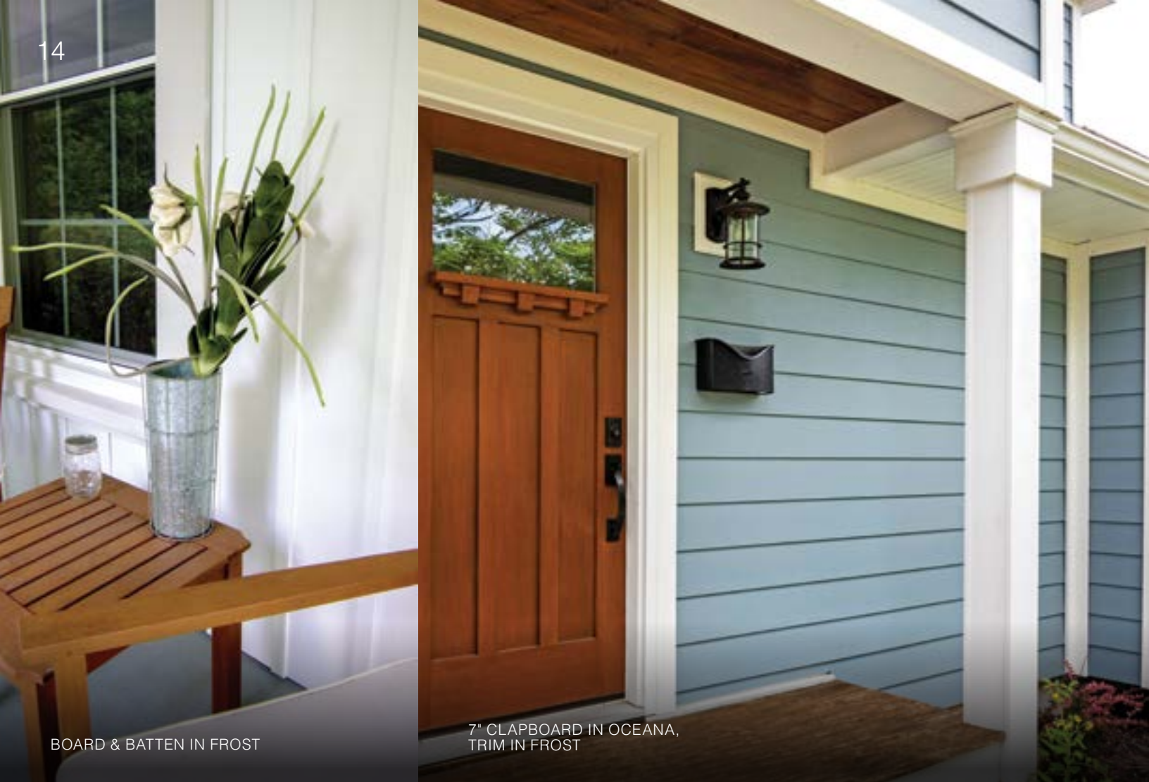
BOARD &amp; BATTEN IN FROST