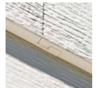
Our patented interlocking joints eliminate gaps, buckling, wavy lines, caulked seams and energy loss.