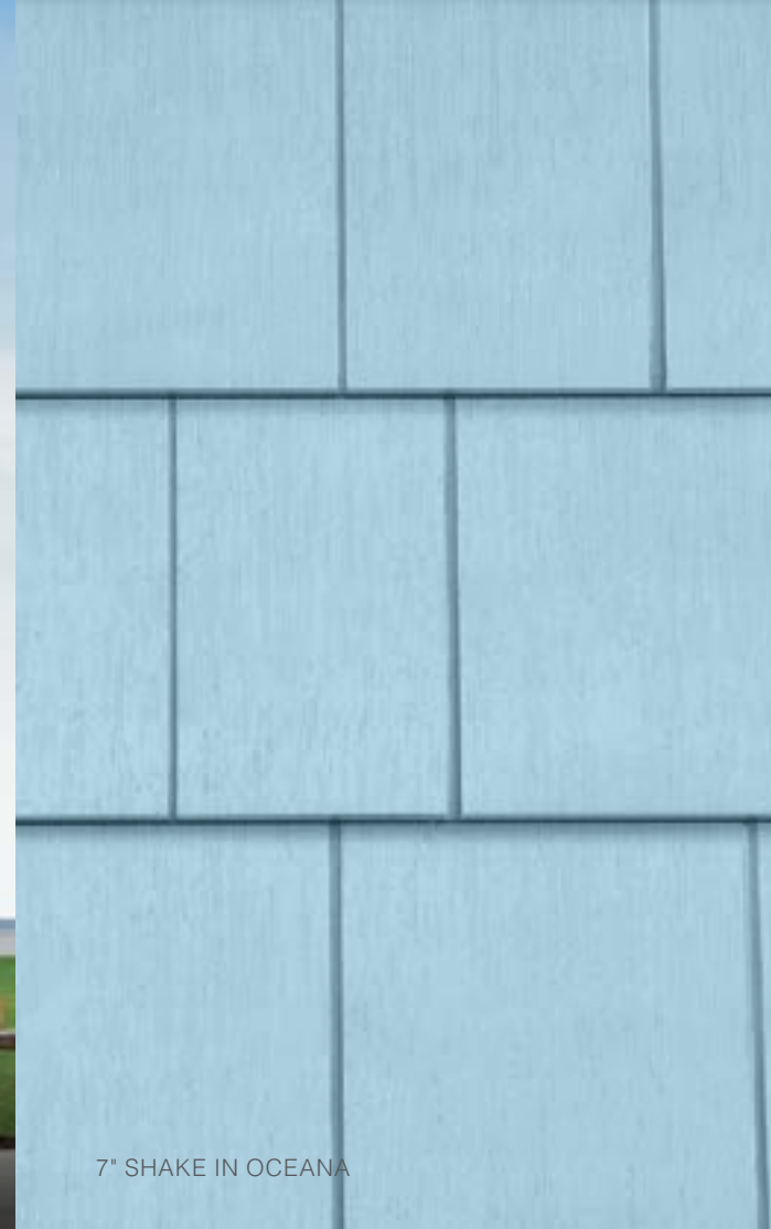
7" SHAKE IN OCEANA