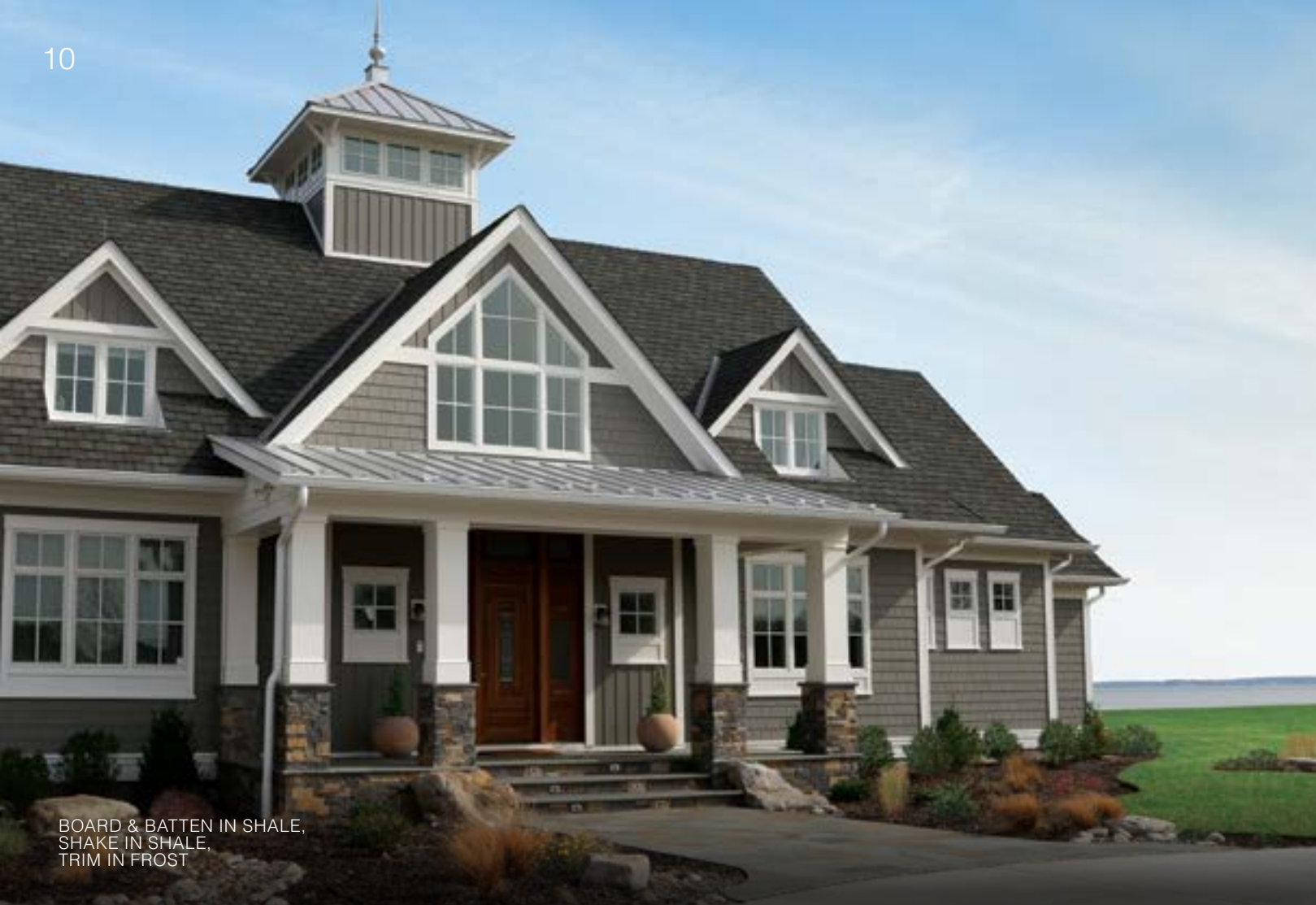
BOARD & BATTEN IN SHALE, SHAKE IN SHALE, TRIM IN FROST