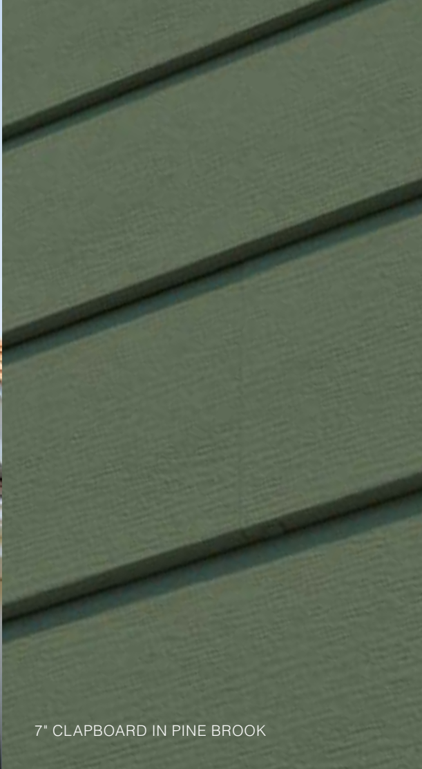
7" CLAPBOARD IN PINE BROOK