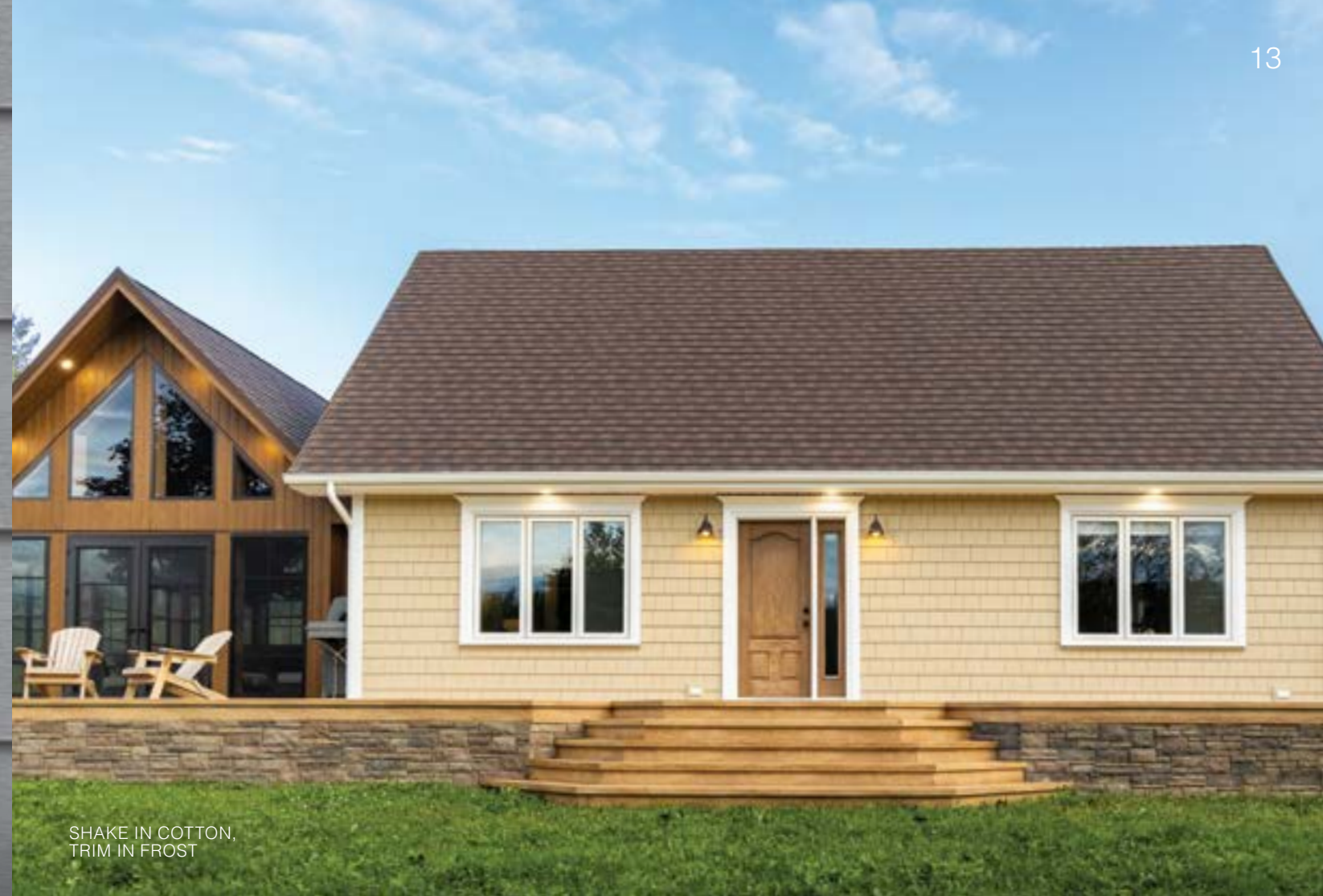
SHAKE IN COTTON, TRIM IN FROST