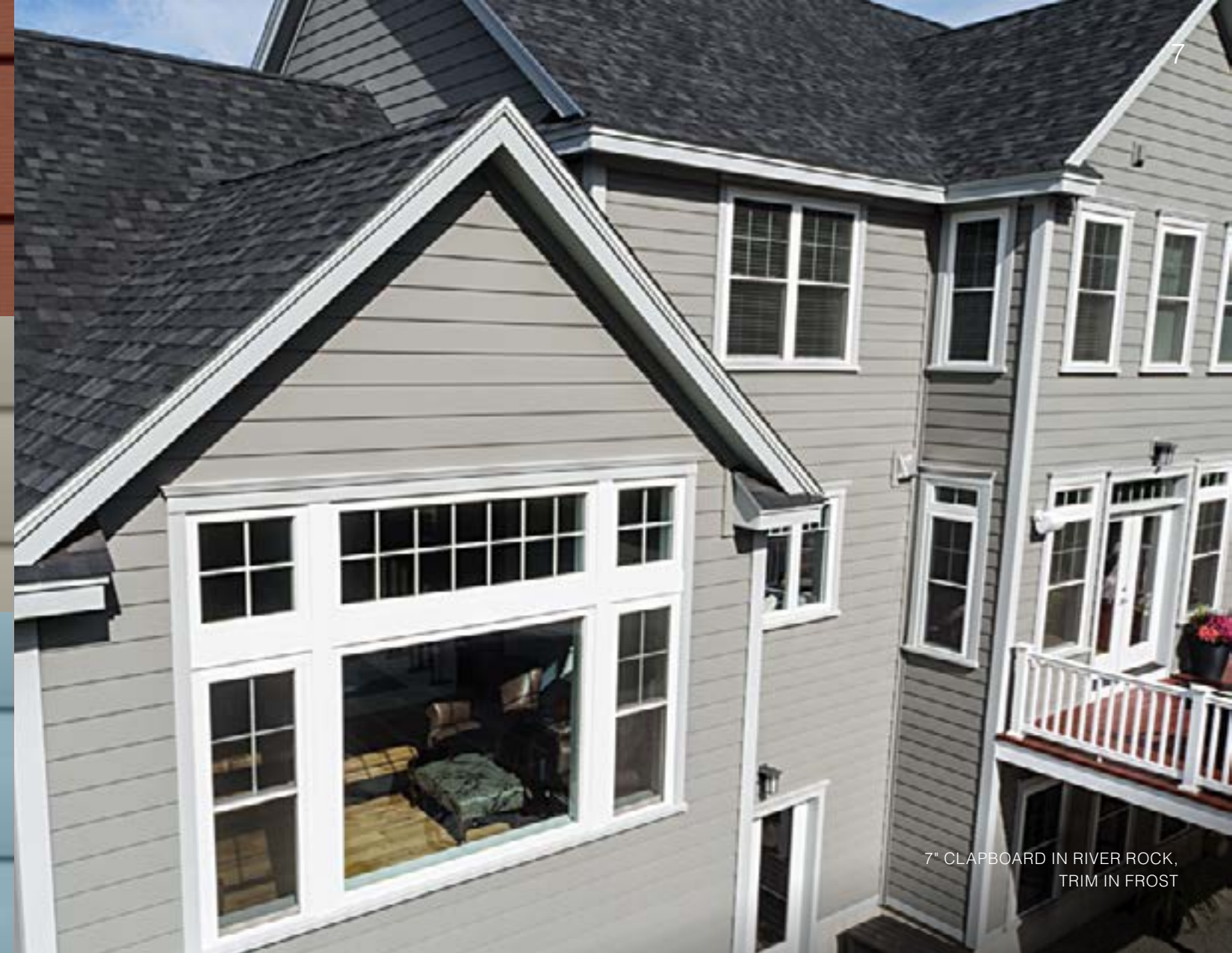
7" CLAPBOARD IN RIVER ROCK, TRIM IN FROST