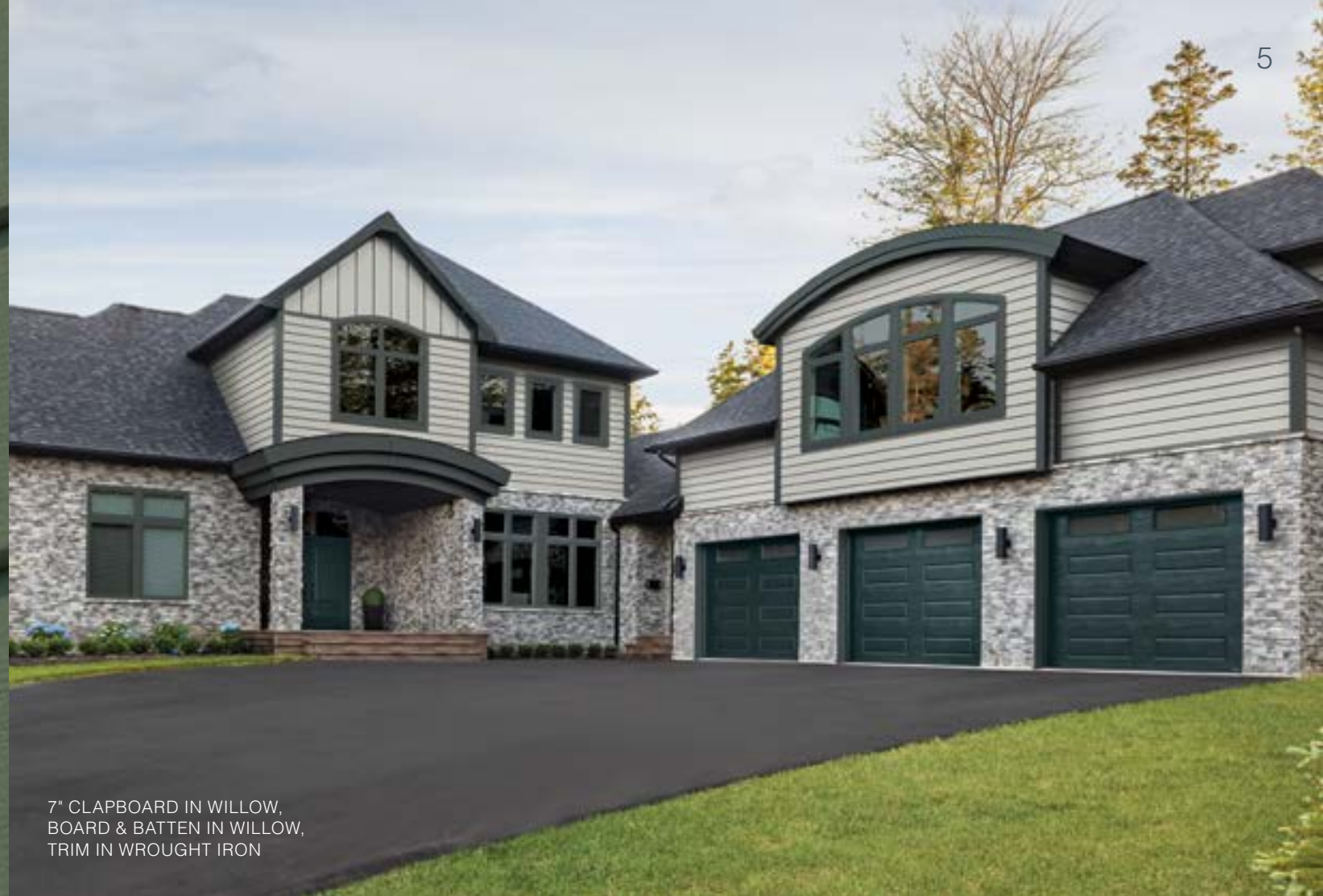
7" CLAPBOARD IN WILLOW, BOARD & BATTEN IN WILLOW, TRIM IN WROUGHT IRON