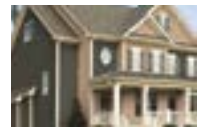
ROYAL® SHUTTERS, MOUNTS & VENTS