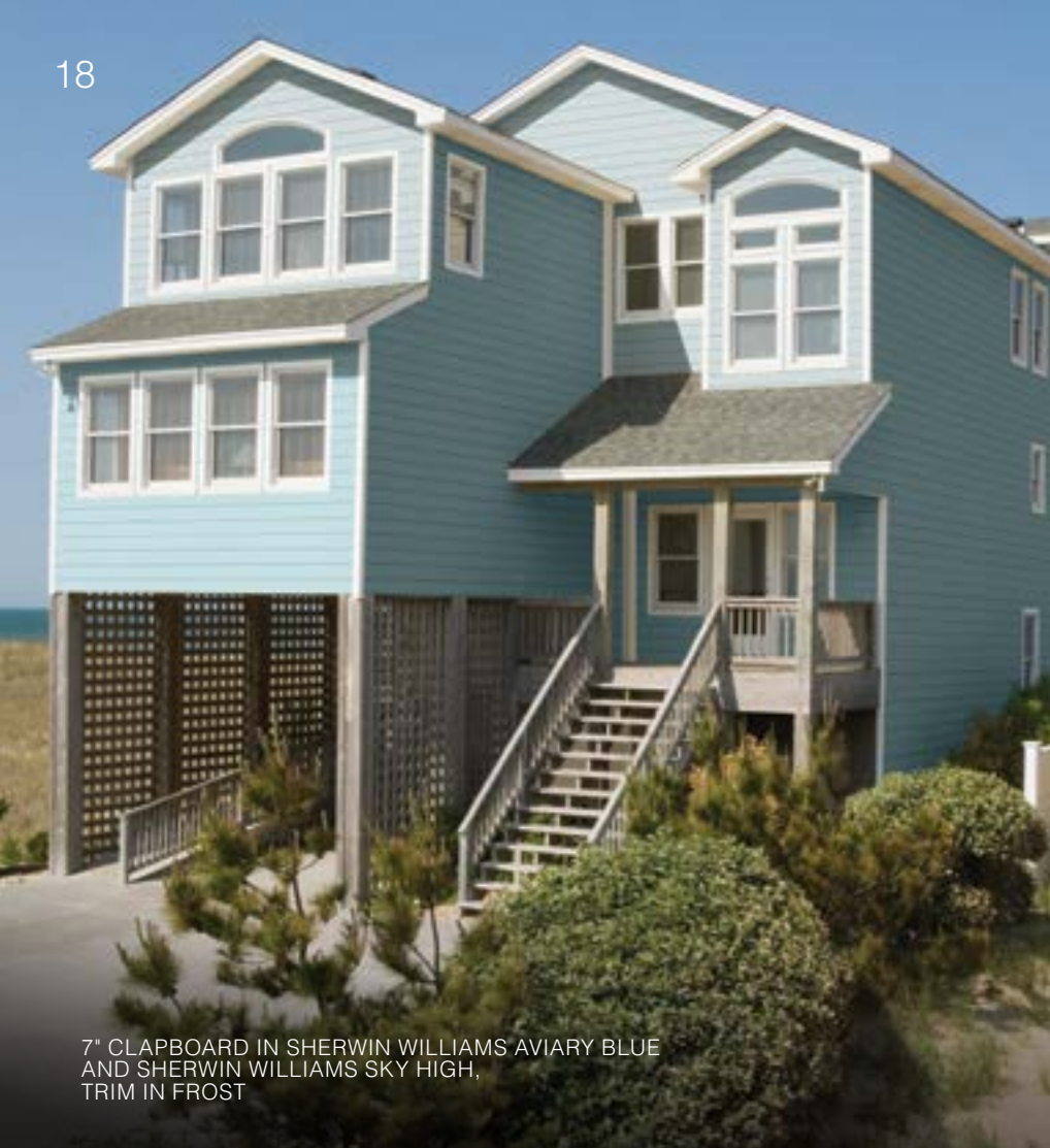
7" CLAPBOARD IN SHERWIN WILLIAMS AVIARY BLUE AND SHERWIN WILLIAMS SKY HIGH, TRIM IN FROST