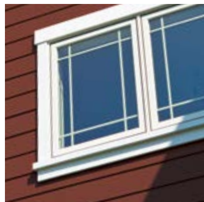
Window surrounds complete the curb-appealing picture.

They come in the same fade-resistant Kynar Aquatec®-coated color palette as Select Siding. So they complement each other perfectly and have the same high aesthetic and low maintenance benefits.