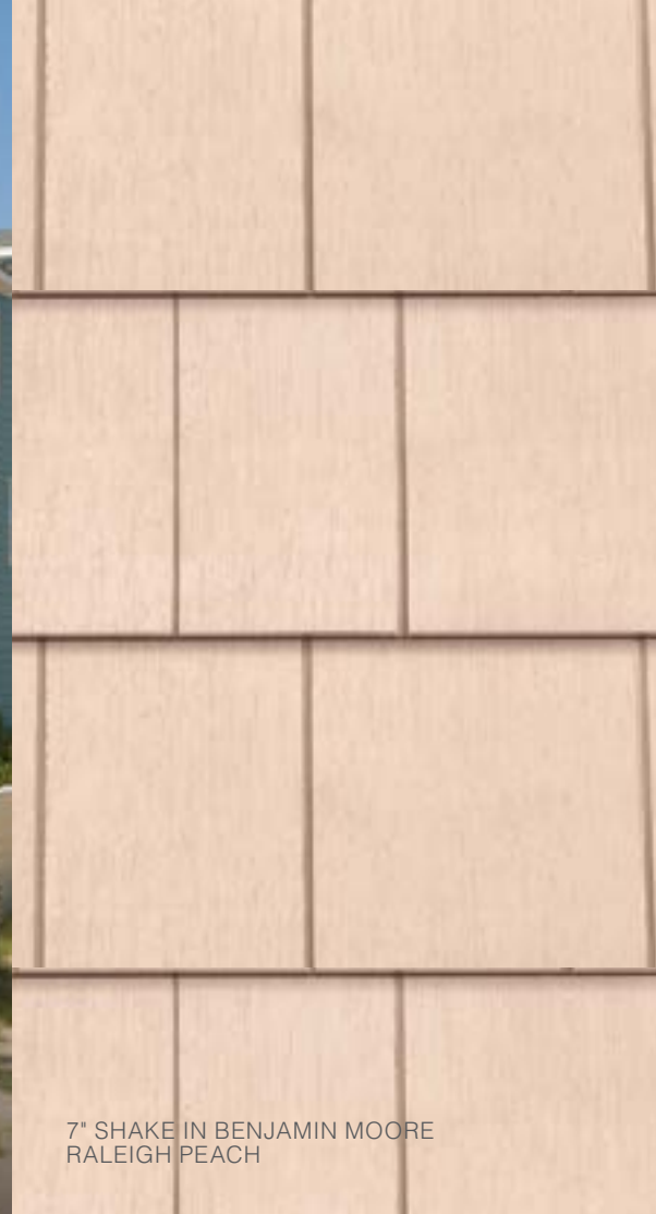
7" SHAKE IN BENJAMIN MOORE RALEIGH PEACH