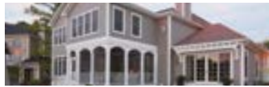
CELECT® CELLULAR COMPOSITE SIDING