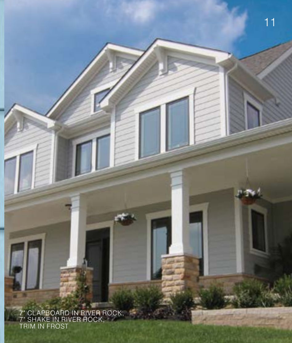
7" CLAPBOARD IN RIVER ROCK, 7" SHAKE IN RIVER ROCK, TRIM IN FROST