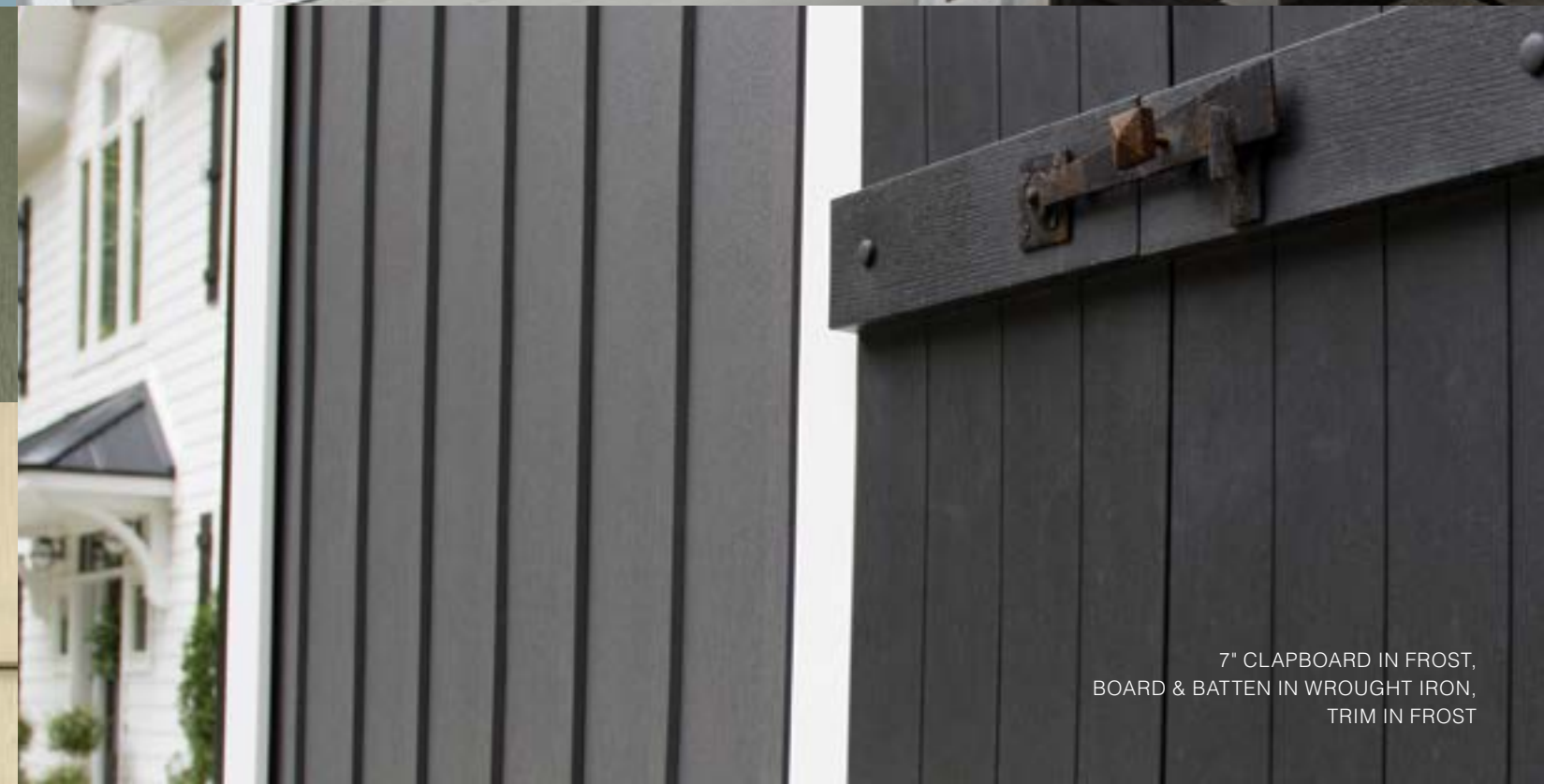
7" CLAPBOARD IN FROST, BOARD & BATTEN IN WROUGHT IRON, TRIM IN FROST