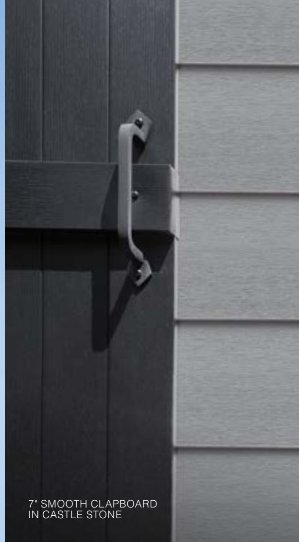
7" SMOOTH CLAPBOARD IN CASTLE STONE