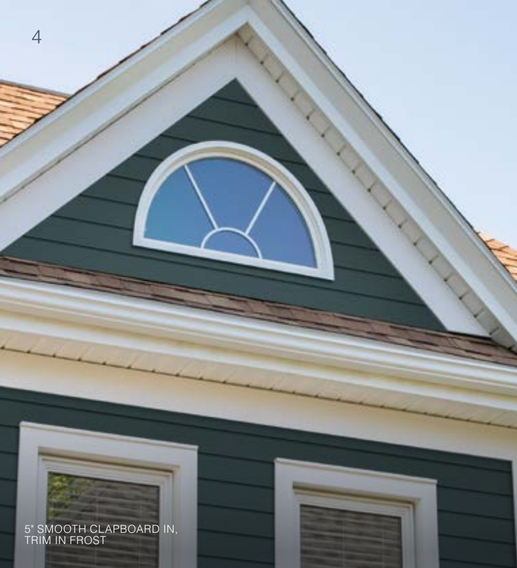
5" SMOOTH CLAPBOARD IN, TRIM IN FROST