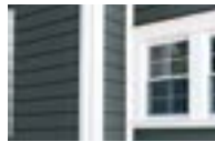
ROYAL® TRIM & MOULDINGS