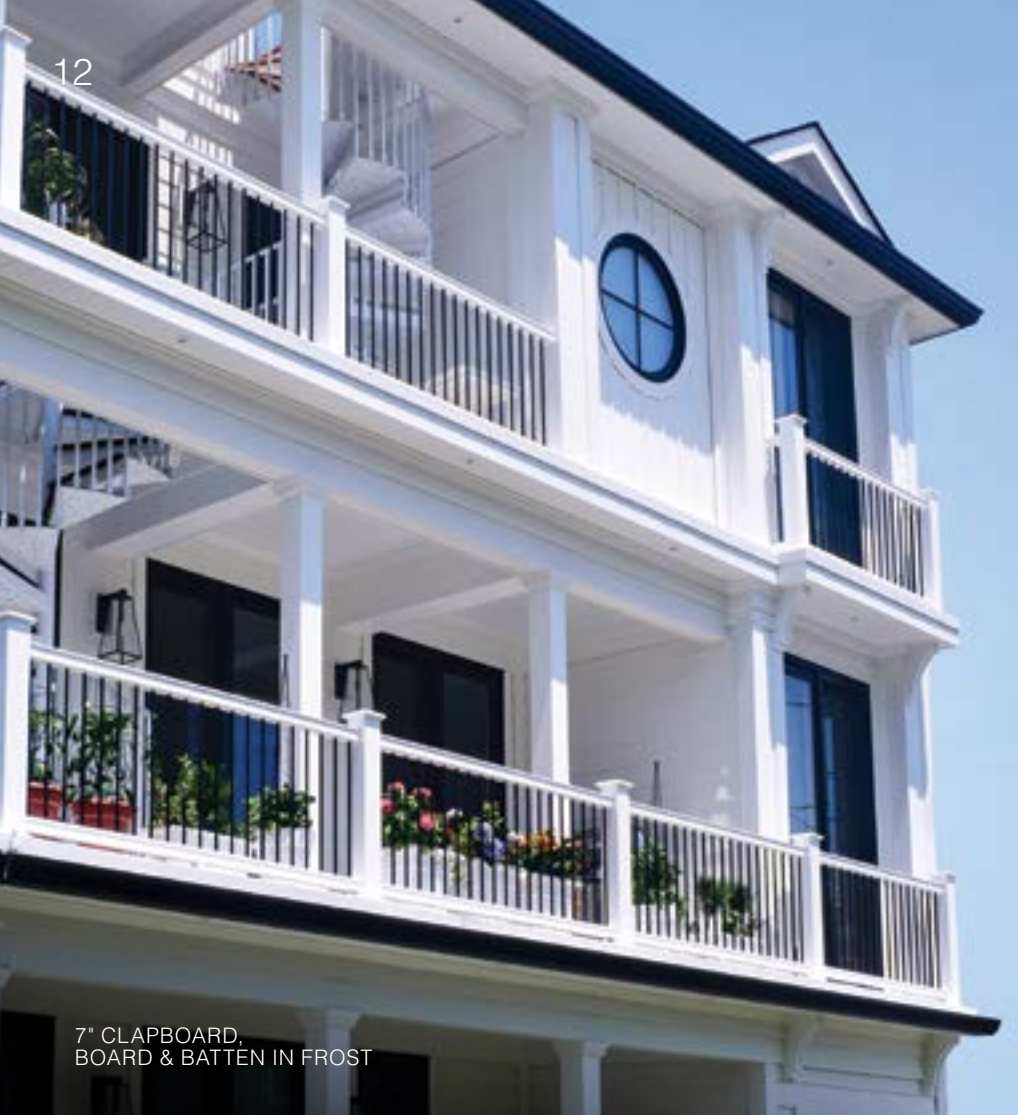
7" CLAPBOARD, BOARD & BATTEN IN FROST