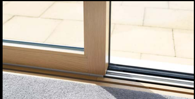
Sliding panel aligns with the mullion