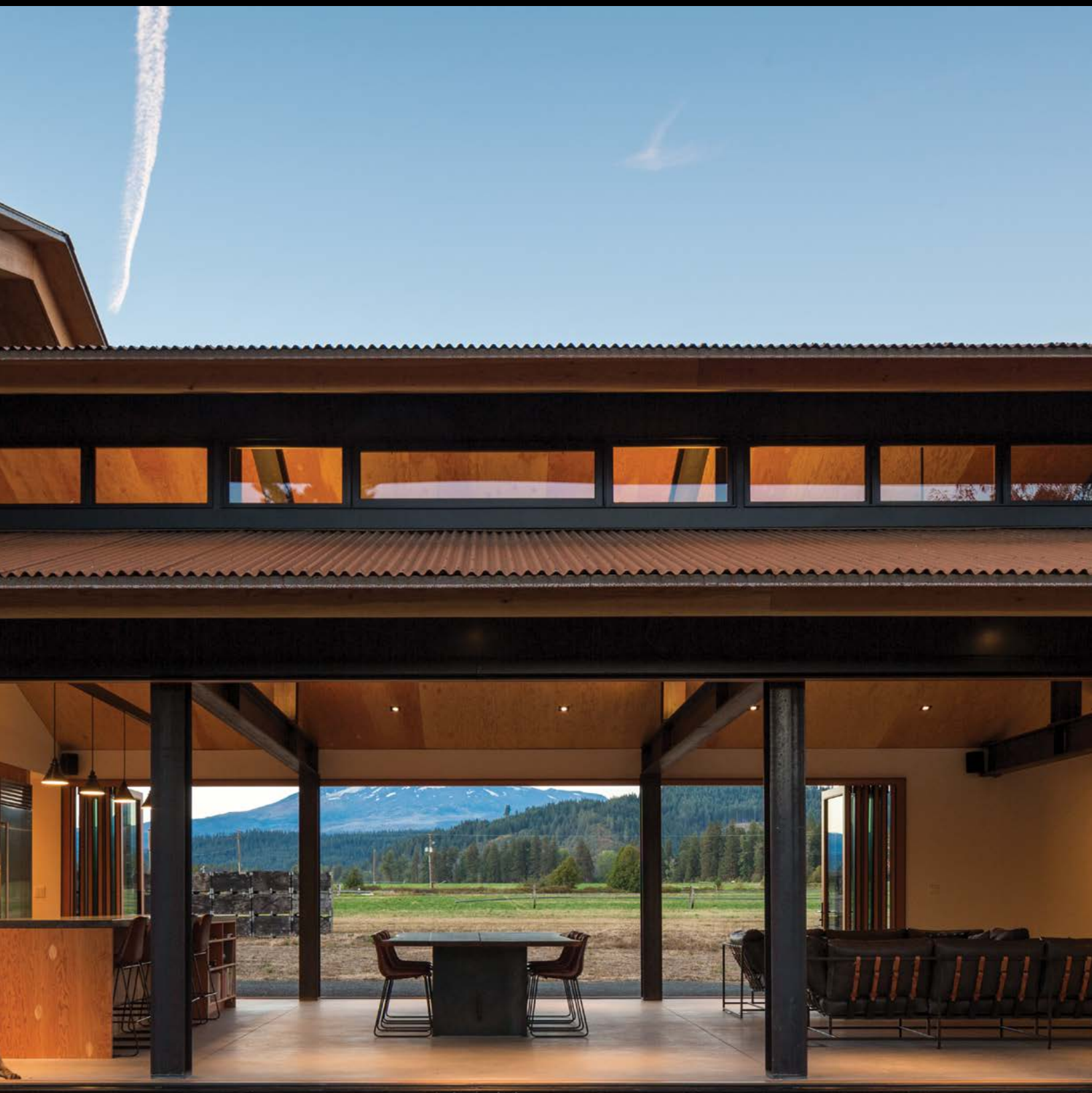
205 Integrated Folding Doors Trout Lake, WA Architect: Olson Kundig Dealer: Glacier Window & Door