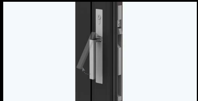
Access Autolatch™ exterior pull-handle