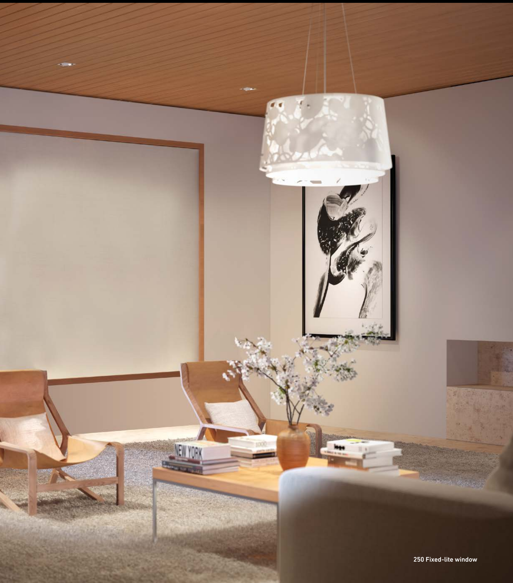
250 Fixed-lite window