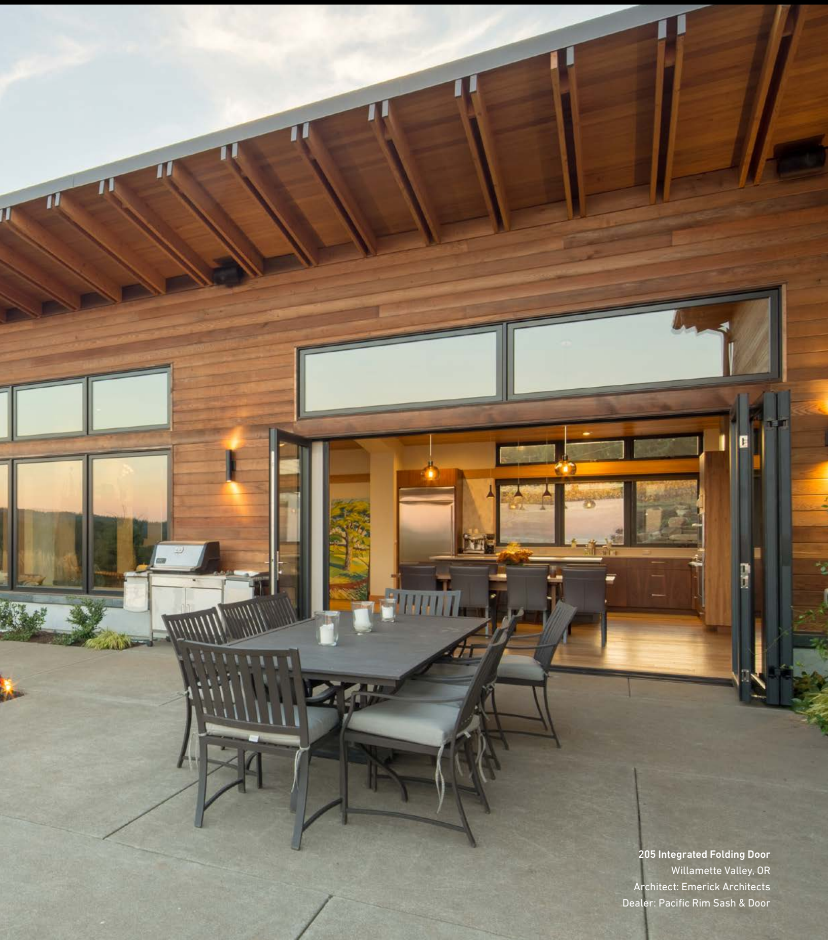
205 Integrated Folding Door Willamette Valley, OR Architect: Emerick Architects Dealer: Pacific Rim Sash & Door