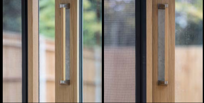
Interior sliding handle

To see the full range of specifications for Sliding Doors, visit centor.com .