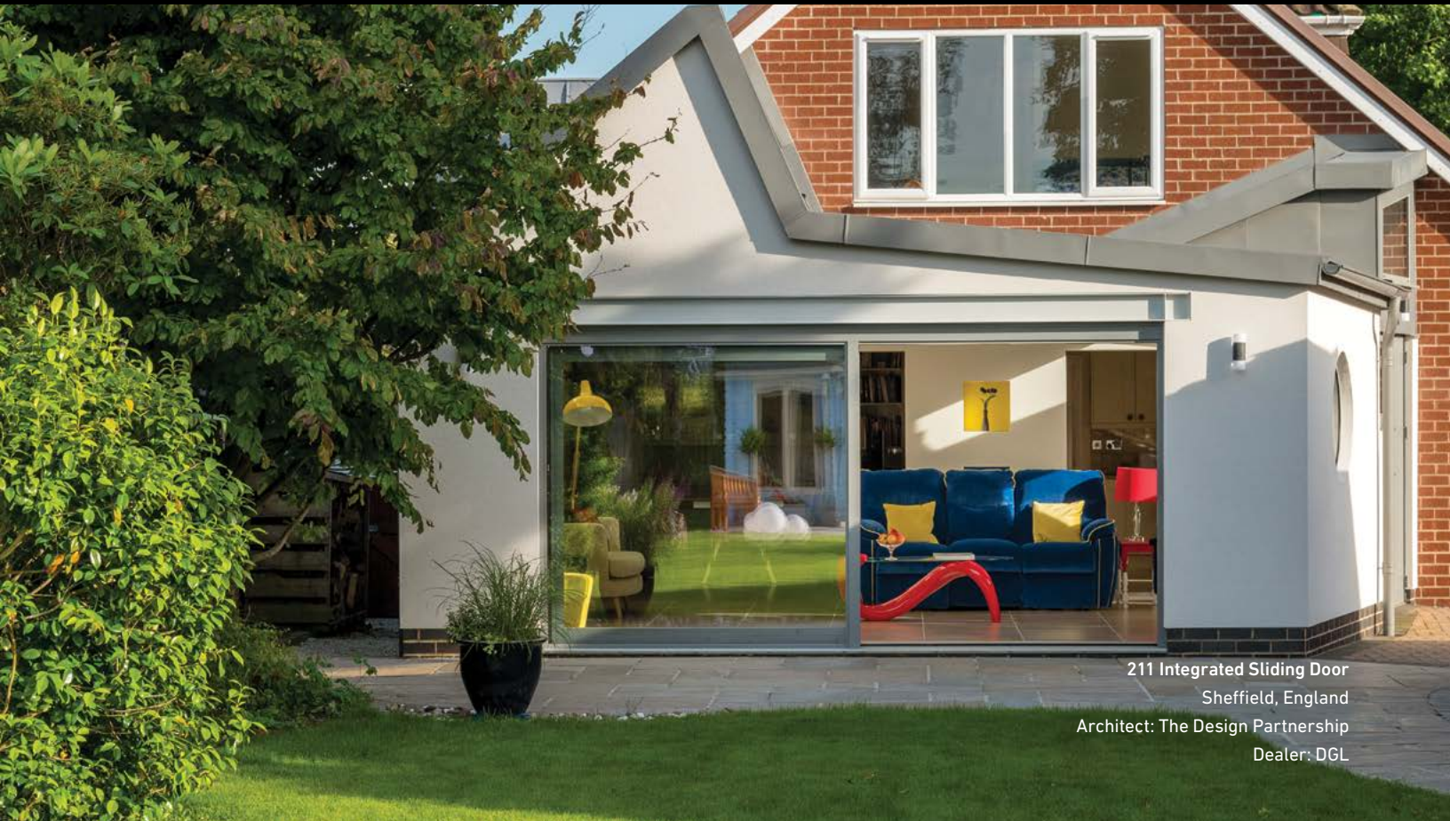
211 Integrated Sliding Door Sheffield, England Architect: The Design Partnership Dealer: DGL