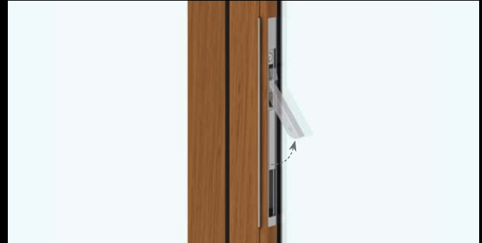
Access Autolatch™ interior lever and signifier

To see the full range of specifications for Folding Doors, visit centor.com .