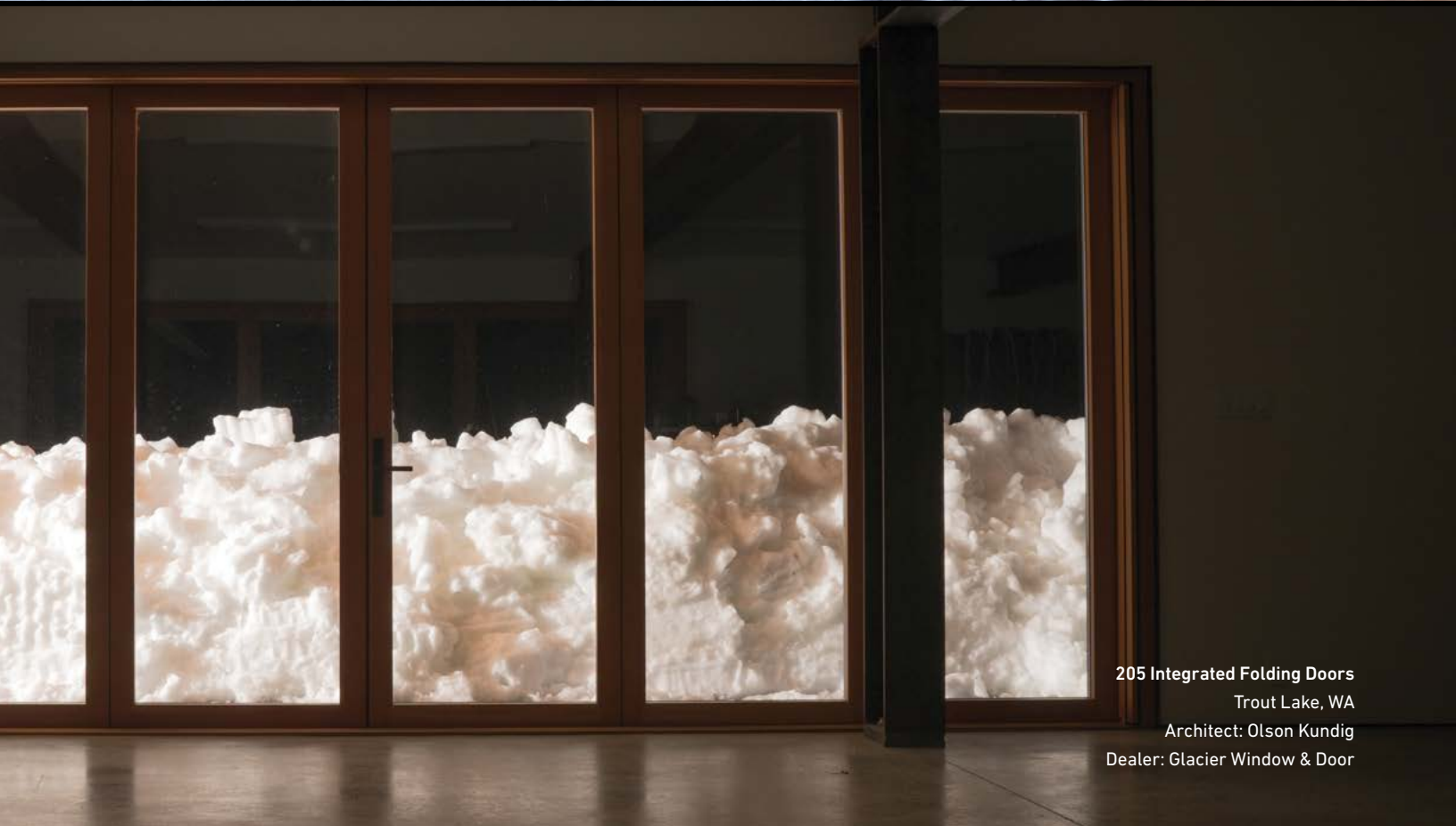
205 Integrated Folding Doors Trout Lake, WA Architect: Olson Kundig Dealer: Glacier Window & Door