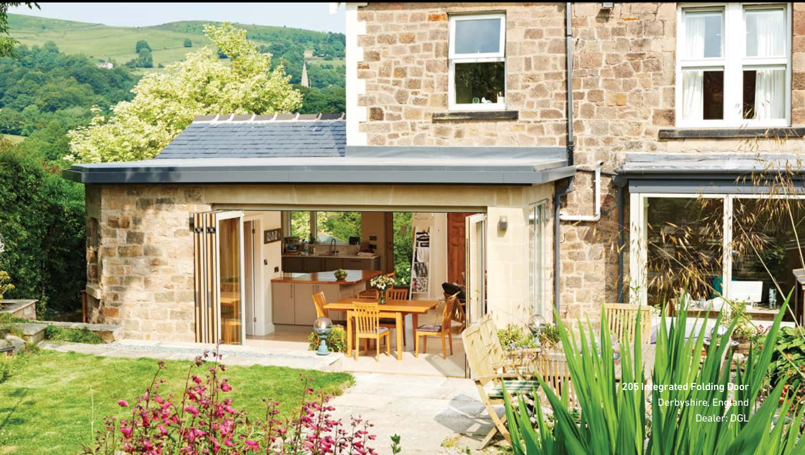
205 Integrated Folding Door Derbyshire, England Dealer: DGL